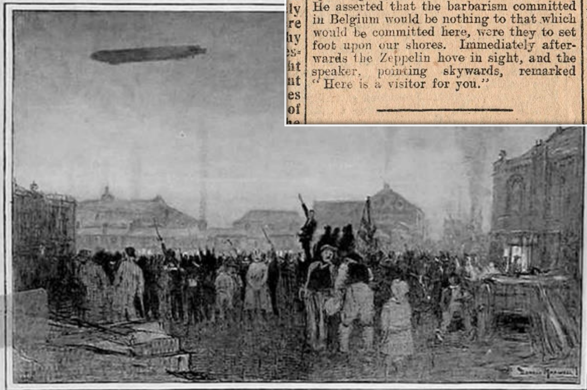
TO POINT THE PATRIOT'S APPEAL, A ZEPPELIN APPEARS AT A RECRUITING MEETING IN THE MARKET SQUARE OF BLYTH.